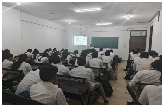
Session on “How to Write and Publish Articles” at B-308 on 5 th June 2025