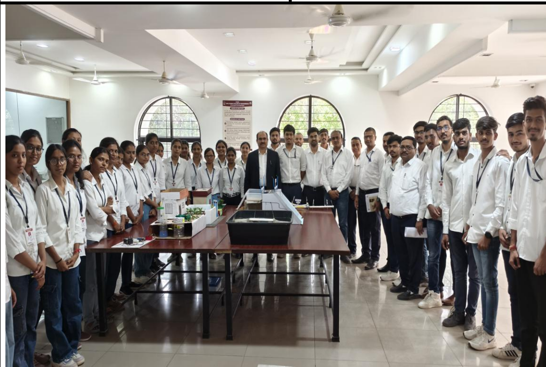
Photographs of Project Competition on World Water Day celebration on 29-03-2025.