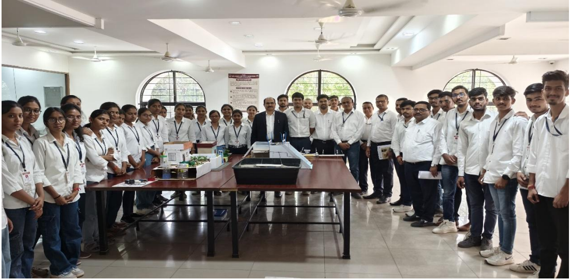
Photographs of Project Competition on World Water Day celebration on 29-03-2025