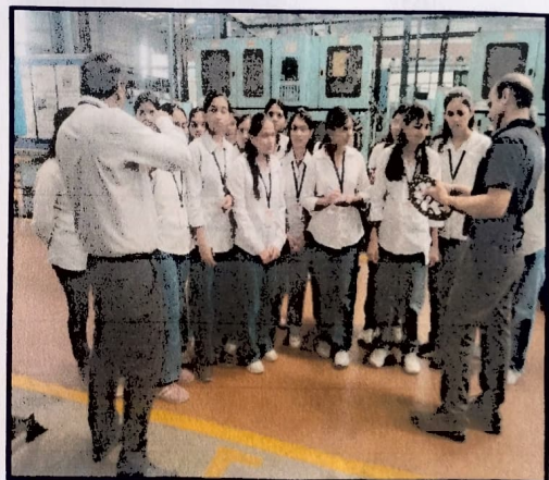
Yamaha Royal Enfield Brake Disc Manufacturing Line