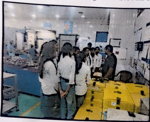
TVS Apache Brake Production Line