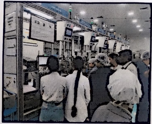
Calliper Assembly Line