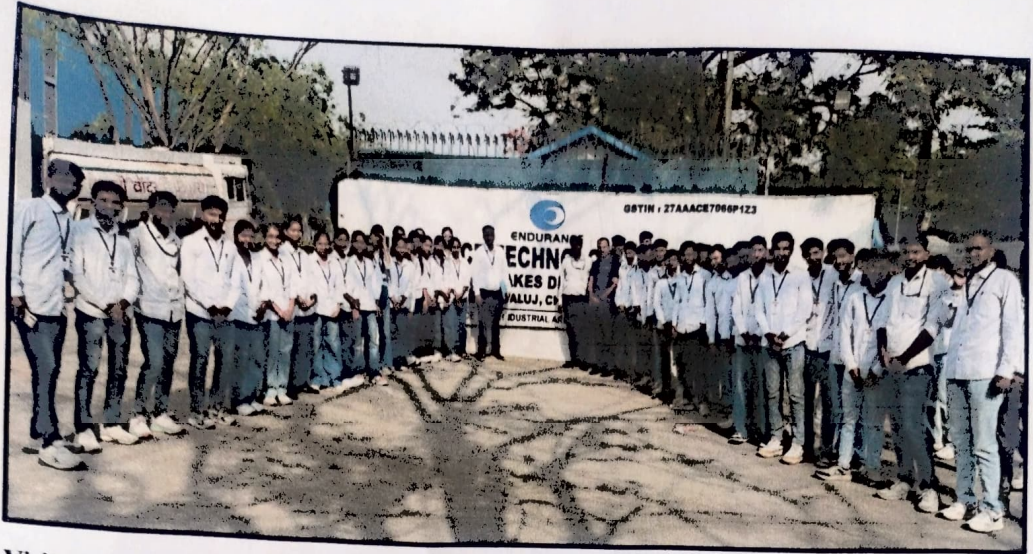
Visit at Endurance technologies Ltd E71 MIDC Waluj Chhatrapati Sambhajinagar.