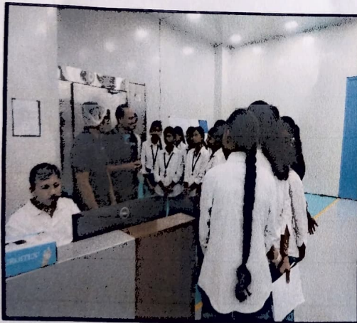
KTM brake assembly Line