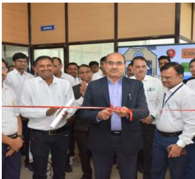
Inauguration Ceremony of Avishkar 2025-26