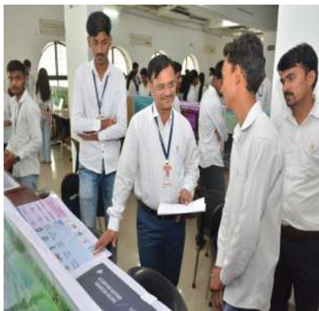
Review and Participation of Students in Event