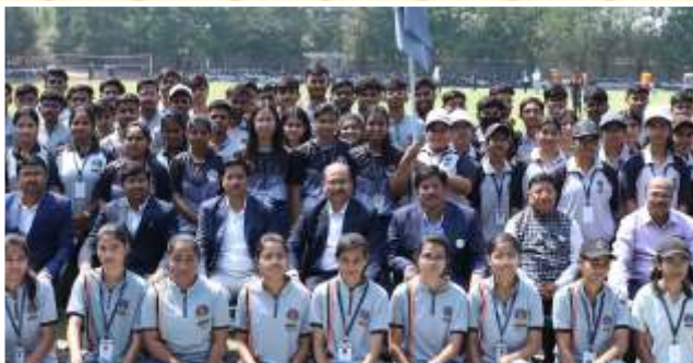
Computer Science and Engineering