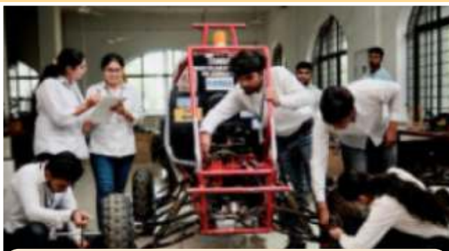
SAE BAJA LAB