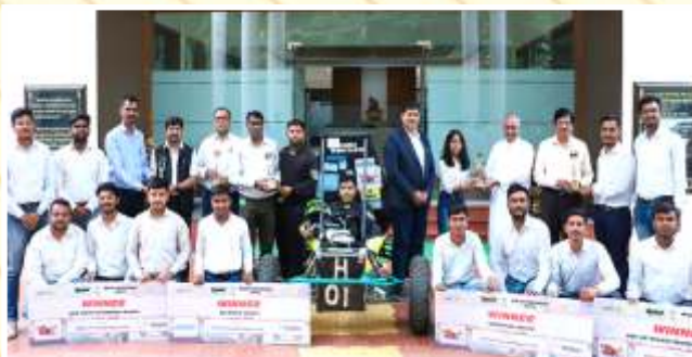
Team SAMSKARA Received Five National Awards including Go-Green Innovation first prize in H-BAJA-2024.