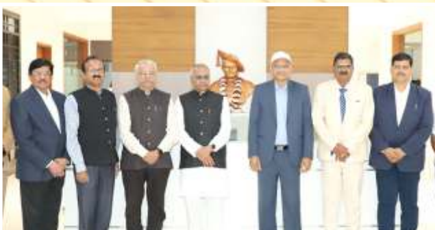
Visit of Hon. Vice-Chancellor, DBATU and Director, DTE to the college.