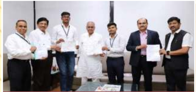
Felicitation of students selected for internship at ISRO Bangalore.