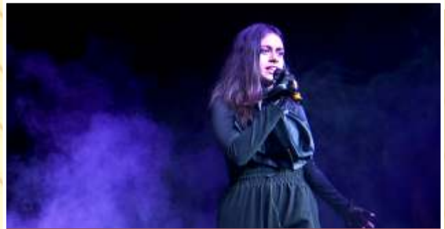
Student during the annual social gathering