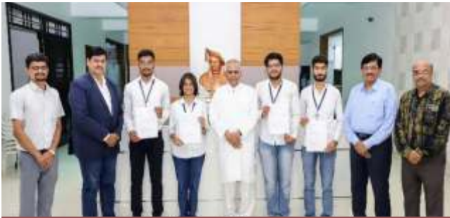
Felicitation of students selected for internship at IIT Madras, Chennai.