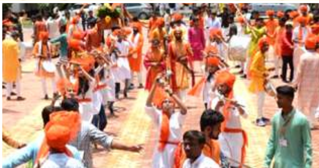
Students during the annual social gathering