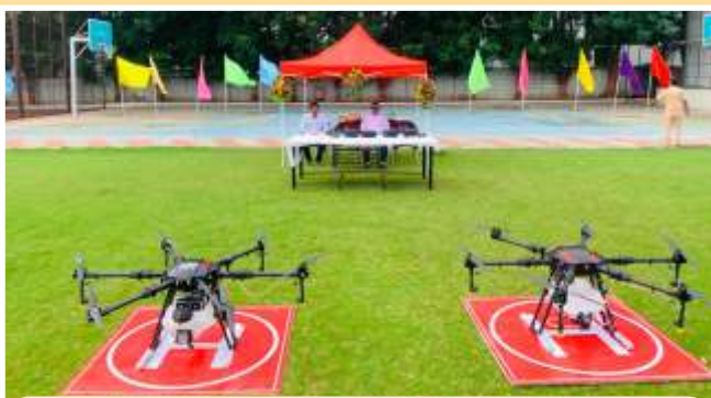
INHOUSE DRONE TRAINING ACADEMY.