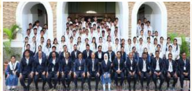
Electronics and Computer Engineering