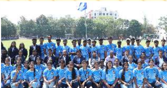
Electronics and Communication (ACT)