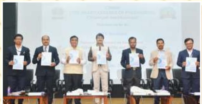
Inauguration of National Conference on Innovations in Science, Engineering, and Technology 2025.