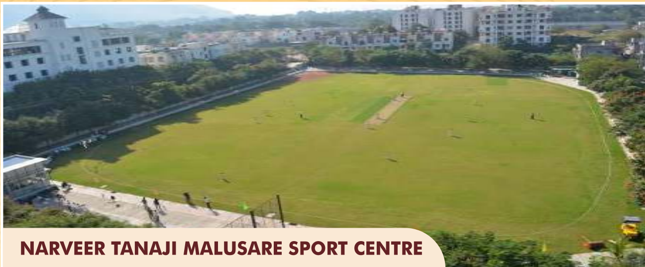
NARVEER TANAJI MALUSARE SPORT CENTRE