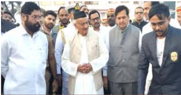
Project presentation by students at Raj Bhavan, Mumbai.