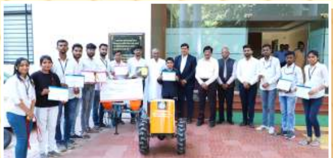
Received fourth rank in "Anveshana" project competition organised by Agastya International Foundation and Samsung India at Mumbai.