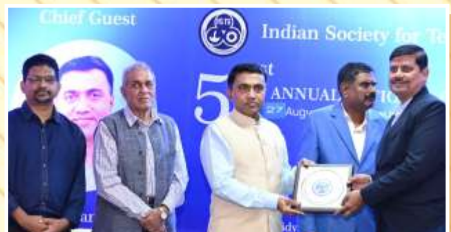
The college received the "Best Engineering College" by ISTE New Delhi.