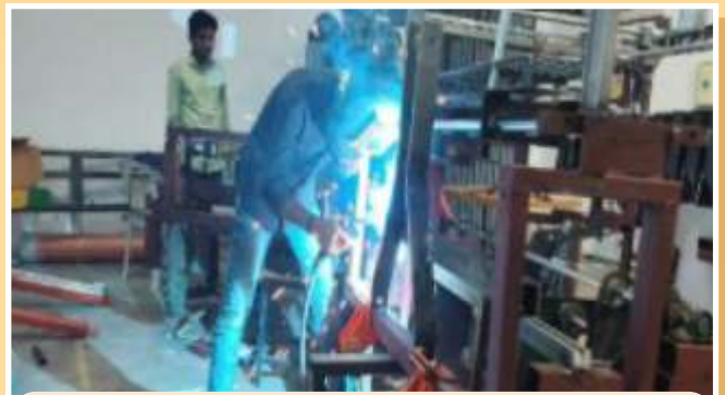
SAE TIFAN LAB