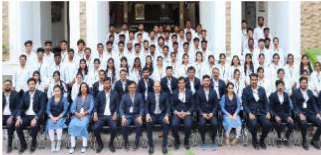
Artificial Intelligence and Data Science