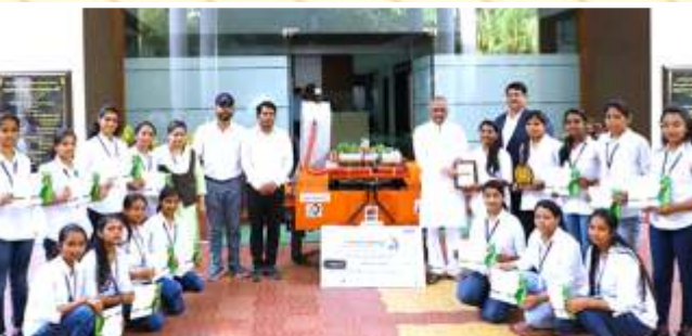
TIFAN team SHAURYA received Blessings of Disguise in TIFAN-2024 competitions at MPKV Rahuri.