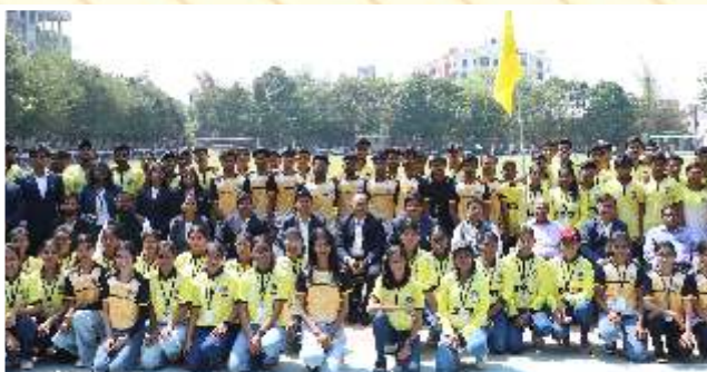
Electronics And Computer Engineering