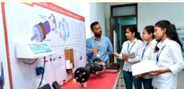
Hands-on learning in the Electric Vehicle Centre of Excellence