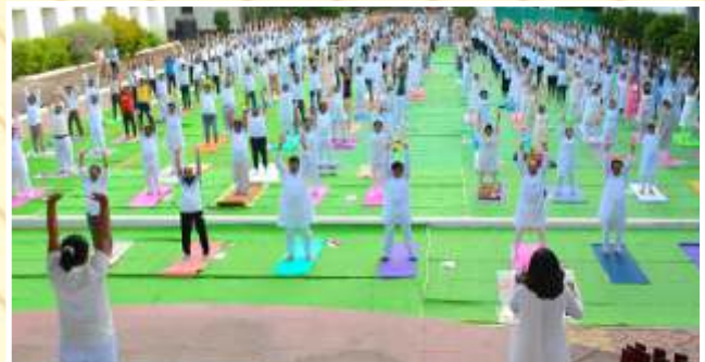
Students and faculty members during Yoga Session