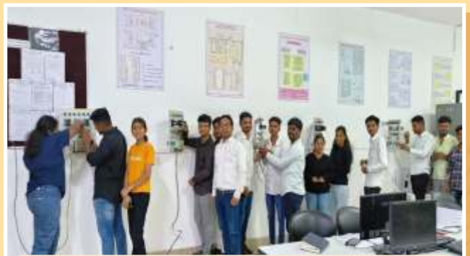
INDUSTRY GRADE AUTOMATION CENTRE.