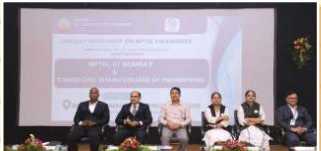
Inauguration of a "One-day workshop on NPTEL awareness" by IIT Bombay.