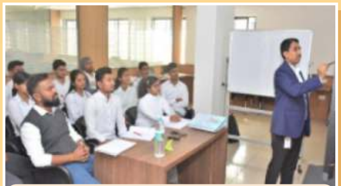
SAP GLOBAL CERTIFICATION TRAINING CENTRE