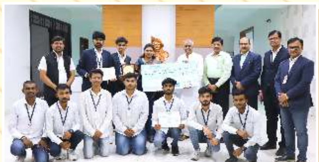
Students team secured "Second Position and received cash prize of 15 Lacs" in International Agriculture Hackathon 2025.