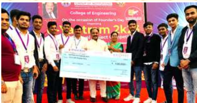
TIFAN team SAMSKARA won first prize and received cash prize of Rs. One Lac in eYantram project competition.