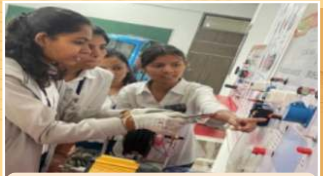
ELECTRIC VEHICLE TRAINING CENTRE