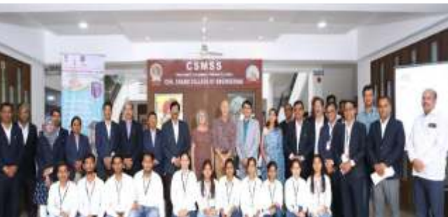
Inauguration of the "Centre for European Studies" on the campus.