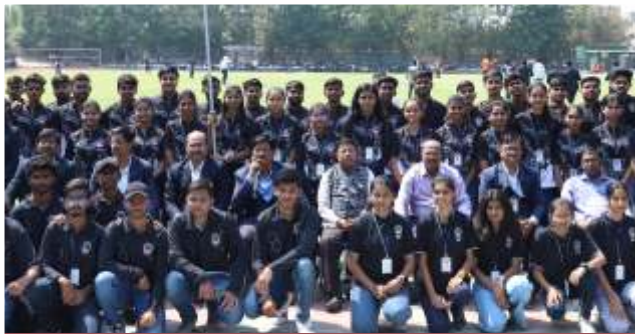
Artificial Intelligence and Data Science