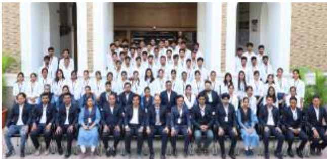
Computer Science and Engineering (A)