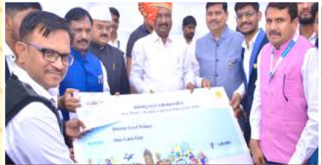
Received a fund of 2.00 Lacs for students' projects from the District Employment office.