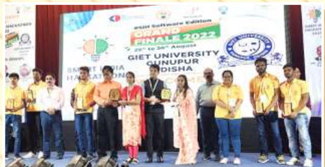
Students received First Prize in National Level "Smart India Hackathon Competition", 2022.