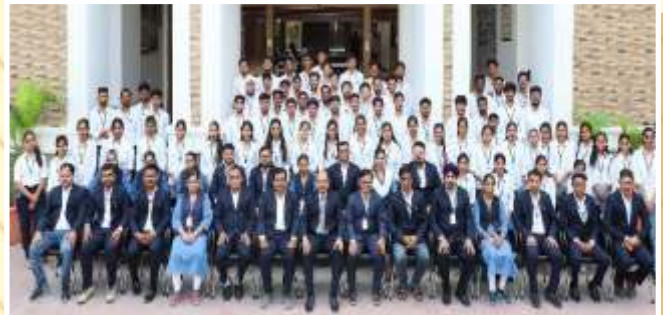
Computer Science and Engineering (B)