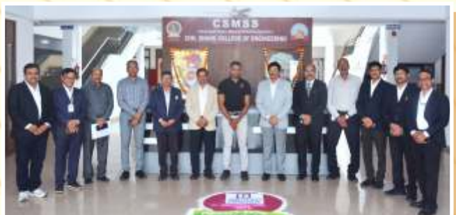
Dignitaries during Project Expo IGNITE 2025.