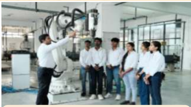
ROBOTICS TRAINING CENTRE