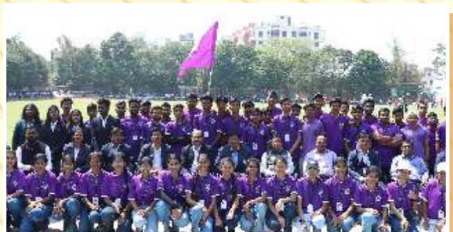
Electronics Engineering (VLSI)