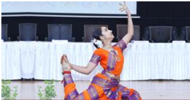
Student performing classical dance in cultural event.